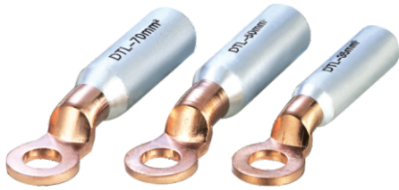
Material: Copper & Aluminium